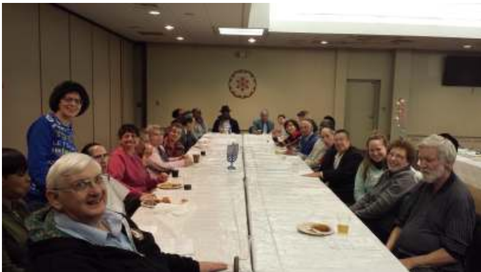
Hanukkah Program for Adults with Special Needs