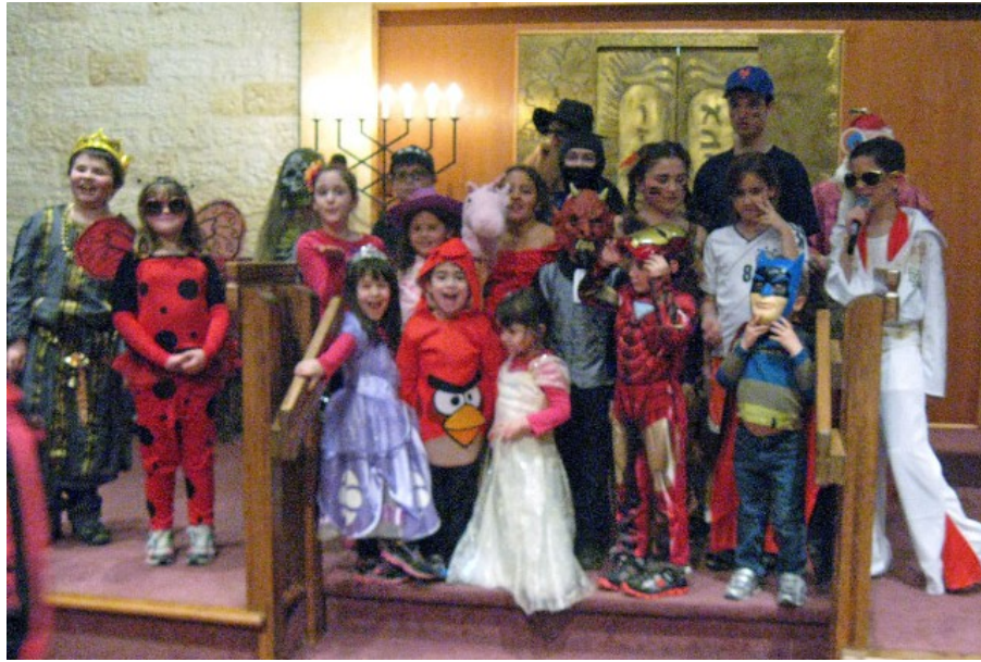
Our Purim celebration had great costumes, delicious food & lots of fun!